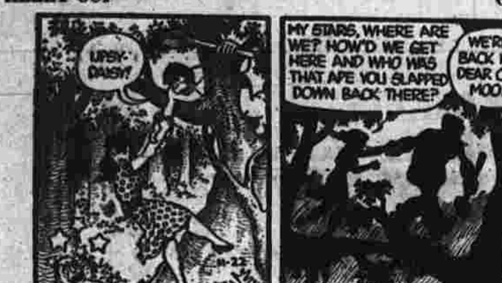
BOOTS AND HER BUDDIES