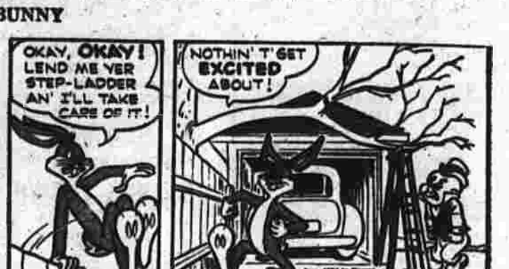
BY JERRY SIEGEL and OGDEN WHITNEY